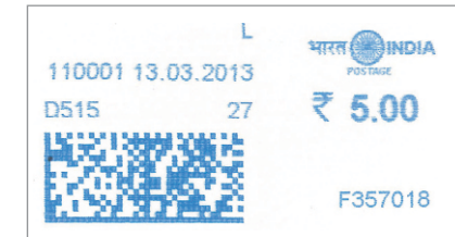
Sample FP Digital Frank Impression